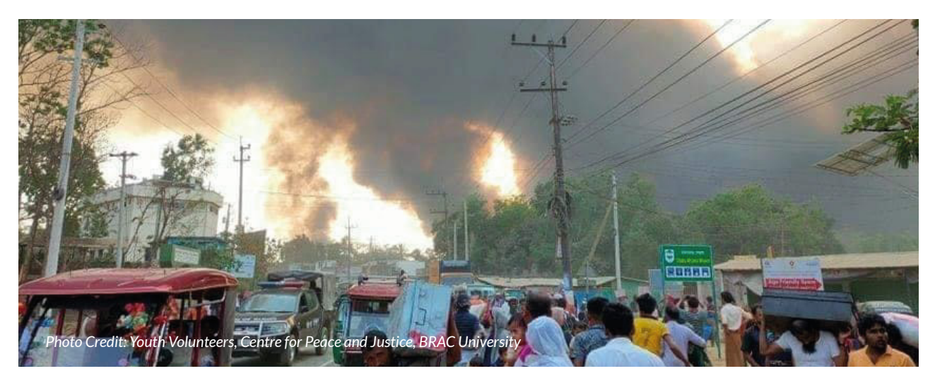
'Crisis within a Crisis': Situation Analysis and Post-Fire Incident Rapid Assessment Report of affected Rohingya Camps

"Many people were injured on the day of the fire accident. Many people got burn injuries. Whereas, many hurt themselves from a fall while they were fleeing. But, they did not receive any health services that day. The next day they received health care services. I did not see any health services that day the fire accident happened." (25 years old female, Camp 9)